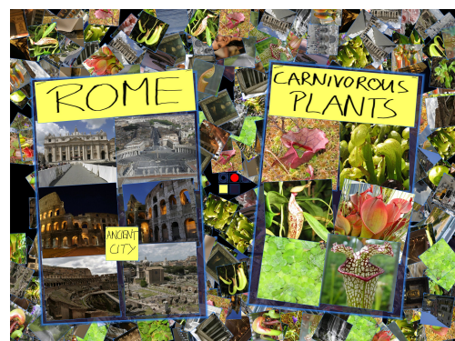
Figure 3: Other application domains: Sticky Notes as headlines for a collage of images or page layout design drafts.