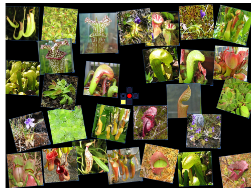
(a) Information to be organized.