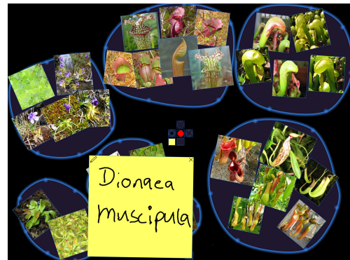
(b) Organized objects and annotation writing.